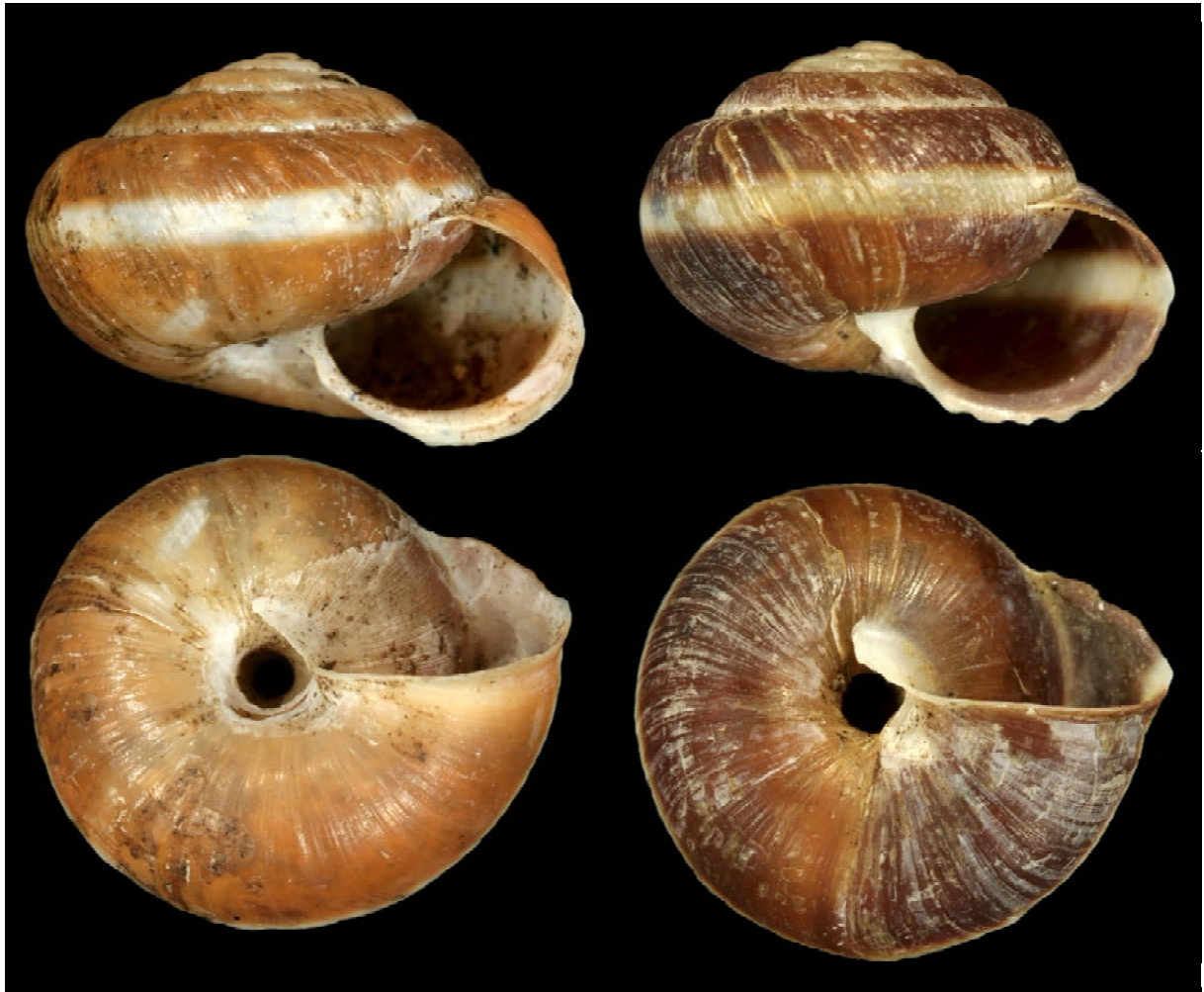
1. Fruticicola boevi .